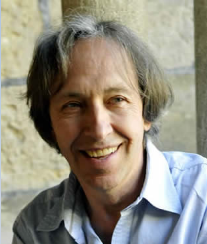
Condemned to Joy

THE WESTERN CULT OF HAPPINESS IS A MIRTHLESS ENTERPRISE