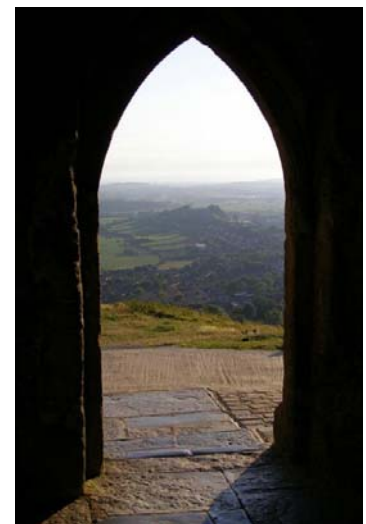
Glastonbury Tor