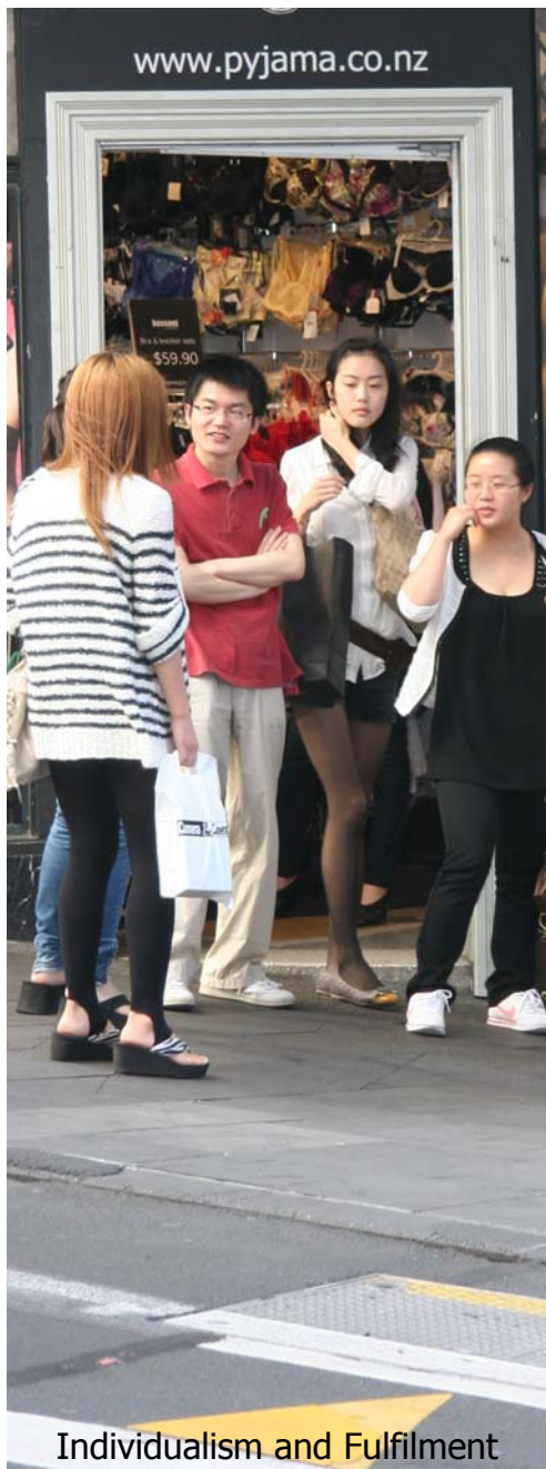
Individualism and Fulfilment

Freudianism, feminism, and the avant-garde in art and politics.